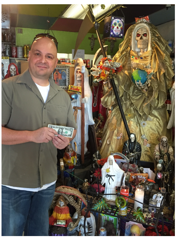
Santa Muerte Chapel Phoenix AZ 2017